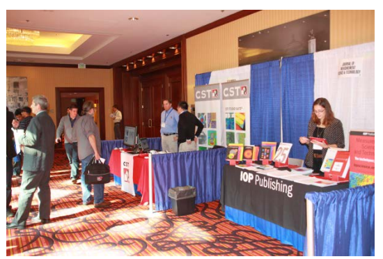
Exhibitors at the IEEE SENSORS 2013 Conference